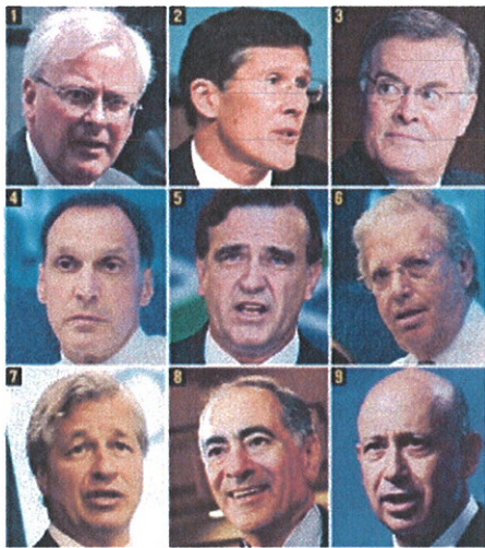
BANK BIGS 1) Varley of Barclays; 2) Merrill's Thain; 3) B of A's Lewis; 4) Lehman's Fuld; 5) Steel of Wachovia; 6) Bear Stearns' Cayne; 7) J.P. Morgan's Dimon; 8) Morgan Stanley's Mack; 9) Goldman's Blankfein

Plagued by hundreds of billions of dollars in write-downs and flagging investor confidence, Wall Street's biggest investment banks have been an endangered species for months. But with Lehman Brothers' collapse into bankruptcy and Merrill Lynch's decision to sell itself last weekend, they took a big step toward extinction.